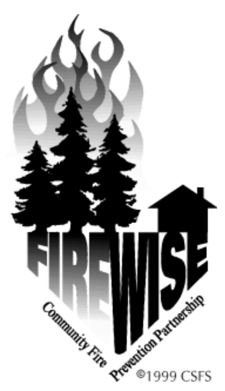
FIREWISE is a multi-agency program that encourages the development of defensible space and the prevention of catastrophic wildfire.