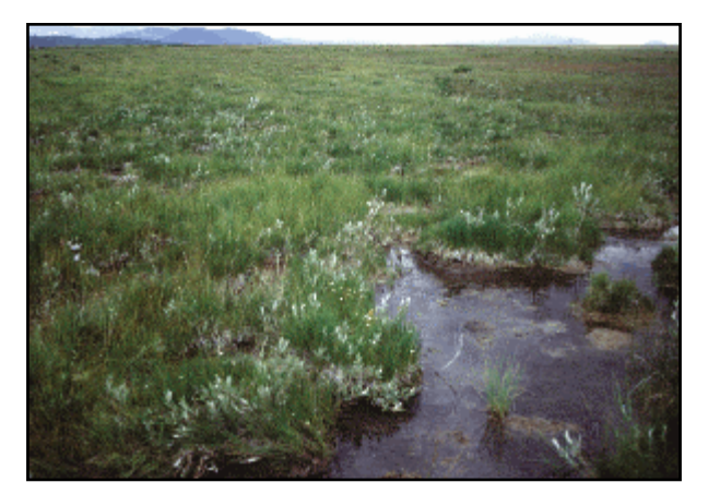
Figure 2. Habitat of Salix myrtillifolia in Colorado.

In Wyoming, Salix myrtillifolia occurs in the Swamp Lake Special Botanical Interest Area on the Shoshone National Forest. This wetland is an extremely rich, patterned fen occurring in the montane zone along the Clarks Fork of the Yellowstone River. Swamp Lake is at 2,012 m (6,600 ft.), and the net relief occupied by