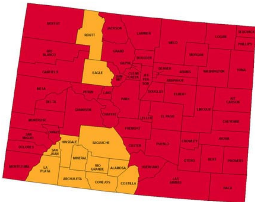
Figure 2: EPA map of radon zones for Colorado. Zone 1 (dark gray), high risk (greater than 4pCi/L). Zone 2 (light gray), moderate risk (2-4 pCi/L).

Once the test is finished, reseal or close the container and send it to the lab specified on the package right away. The lab fee for interpreting the results is usually included in the original cost of the kit. You may choose to have radon measurements performed by a professional. The Colorado Department of Public Health and Environment, Radiation Control Division, can provide a list of companies qualified to perform radon tests for homeowners in the state.