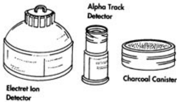
Figure 3: Examples of test kits approved by the EPA.