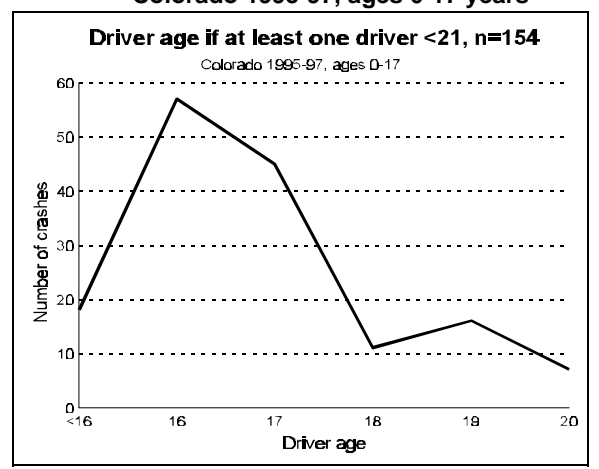
Figure 2: Age of youngest driver in crashes in which at least one driver was under 21 Colorado 1995-97, ages 0-17 years

crashes in which children died during 1995-97 involved drivers under the age of 21. Of the 154 crashes involving young drivers, 16-year-old drivers were involved in 37 percent and 17-year-olds in 29 percent (Figure 2).