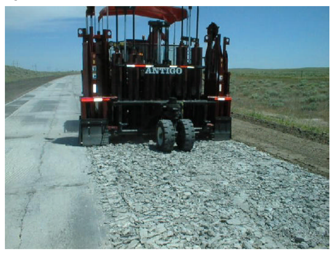
This multi-head hammer truck is rubblizing this concrete pavment.

Implementation: A seminar and a field trip to the construction site have been completed. No other projects are planned pending completion of performance monitoring.