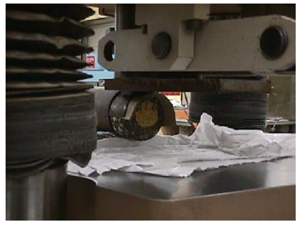
The pavement sample being tested was soaked in magnesium chloride before an overlay was added. This machine is testing the sample for shear strength.

This research report focused on the effect magnesium chloride has had on asphalt pavements. Region 6, in the Denver Metropolitan Area, had some stripping occurring on pavement surfaces and suspected it was due to magnesium chloride. It was also noted that when pavements were placed in two lifts, one in the fall and the other the following spring, the bond between the two was weaker. It was suspected that this poor bond was attributable to the magnesium chloride placed during the winter months. On a different note, but equally troubling, was the lack of adhesion of thermoplastic pavement marking to roadways treated with magnesium chloride.