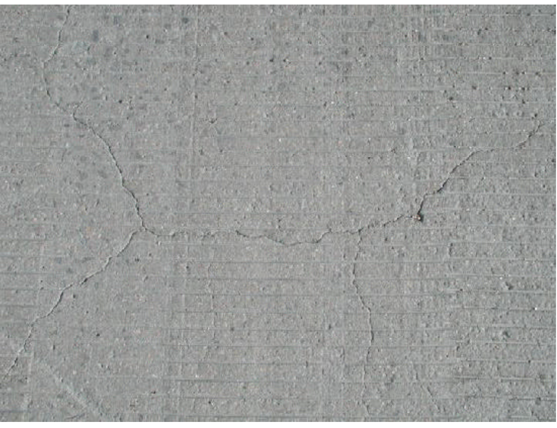
This bridge deck is showing extensive cracking.

Implementation: Most of the construction recommendations to alleviate bridge deck cracking problems were incorporated in CDOT specifications. Some of the design recommendations were implemented in the design of the IBRC (Innovative Bridge Research and Construction) structure at I225/SH83 interchange. The DSL concrete mix recommended in this study was investigated further in the IBRC research study for developing a high performance concrete mix for CDOT.