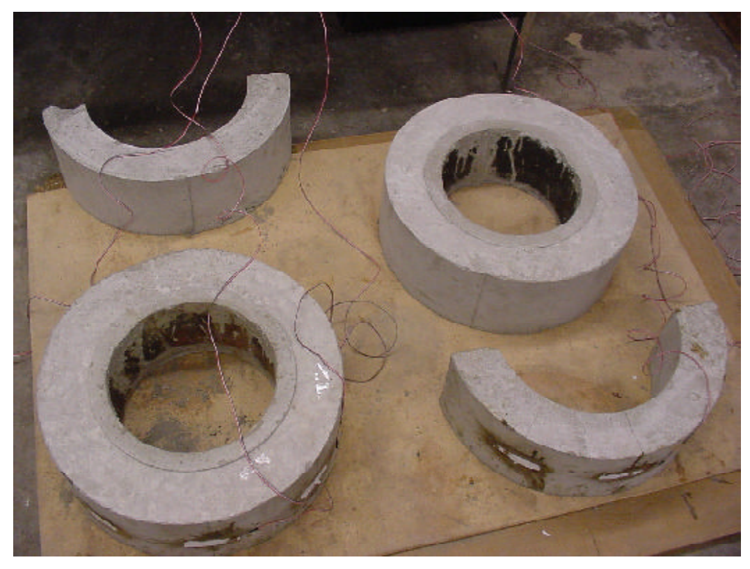
The ASTM 14-day Ring Test examines the cracking potential of concrete mixes.

already cement-rich mixes may not be the best approach in addressing long-term PCCP performance. With the escalation of costs for concrete materials - especially cement, maintaining or even extending the performance of PCCP, while reducing the initial costs, is desirable. This research will demonstrate that a lower cement content for pavement maintains durability, and results in reduced shrinkage and thermal cracking, while maintaining current standards for workability and strength.