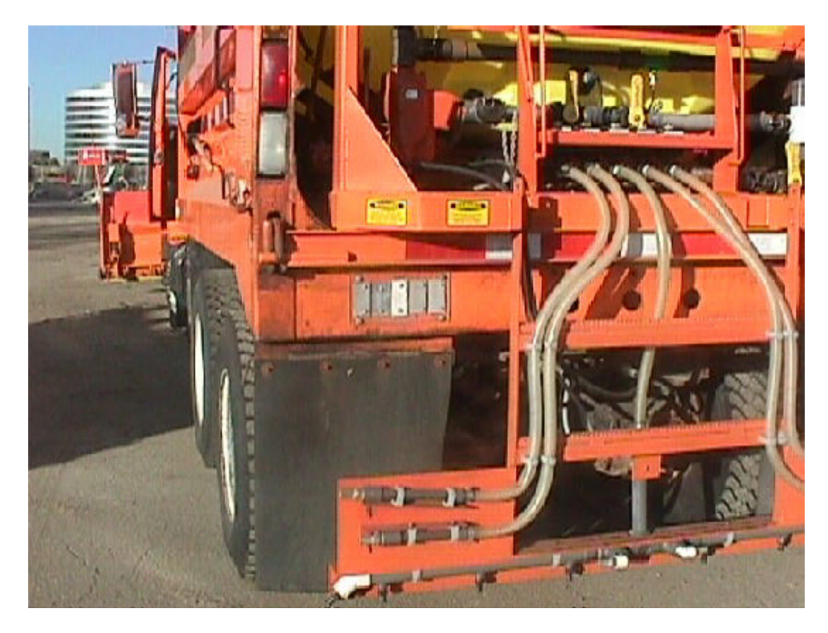
This CDOT Maintenance chemical deicing distributor truck has five test "coupons" (steel squares) mounted on the back of the truck to determine corrosion rates due to chemical deicing.