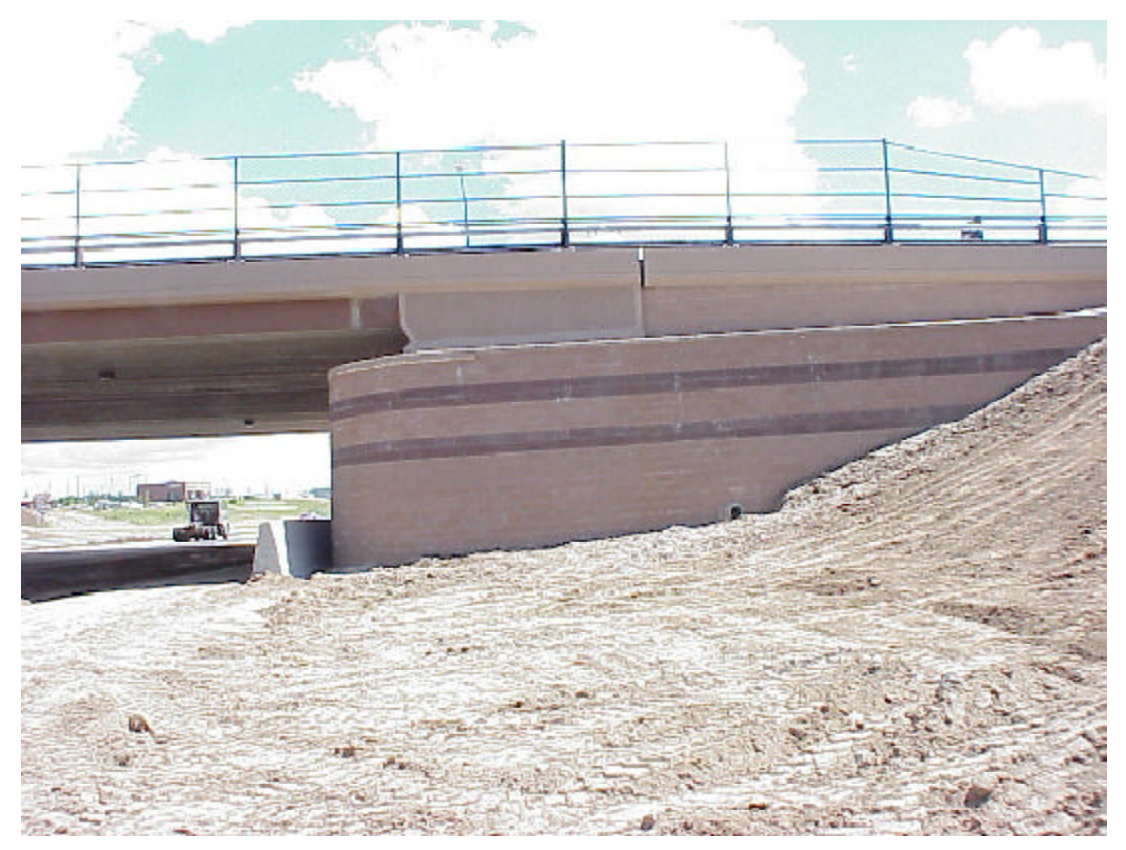
The Founders-Meadows Parkway bridge in Colorado Springs uses geosynthetic-reinforced soil walls.