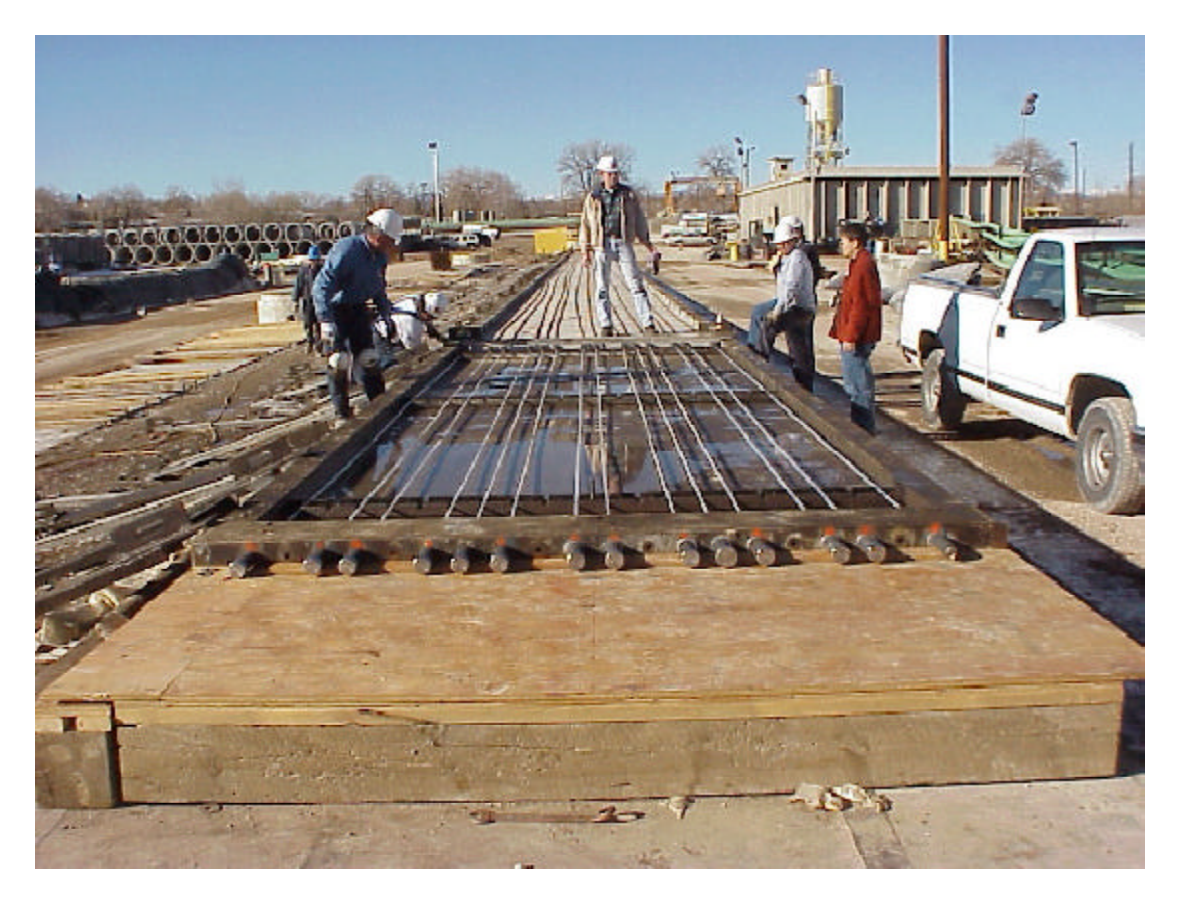
This photo shows a prestressed carbon fiber precast bridge panel. This project is the first time that CDOT has not used steel for reinforcement.