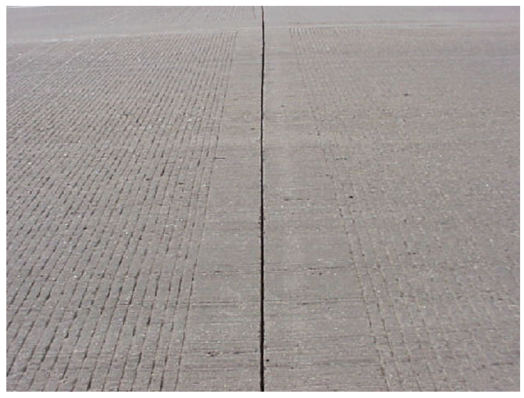
This concrete pavement joint has been left unsealed.