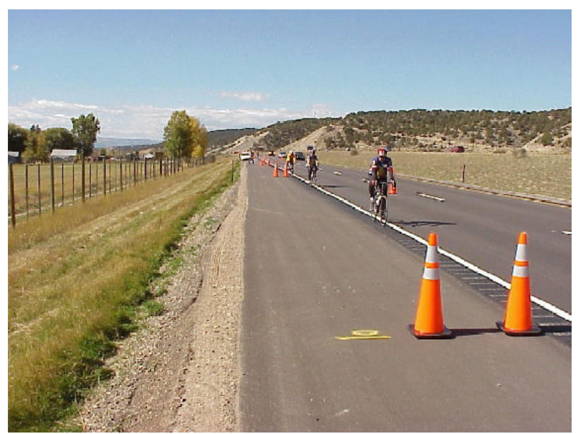
Bicyclists test rumble strips placed along side the edge of the road.

Implementation: The results of the study were presented to the Discussion Group Panel for Standard Plans who determined that a revision to the Colorado Plans was appropriate. The standard for ground-in rumble strips was changed from \frac{1}{2} " deep to \frac{3}{8} " deep for all future construction.