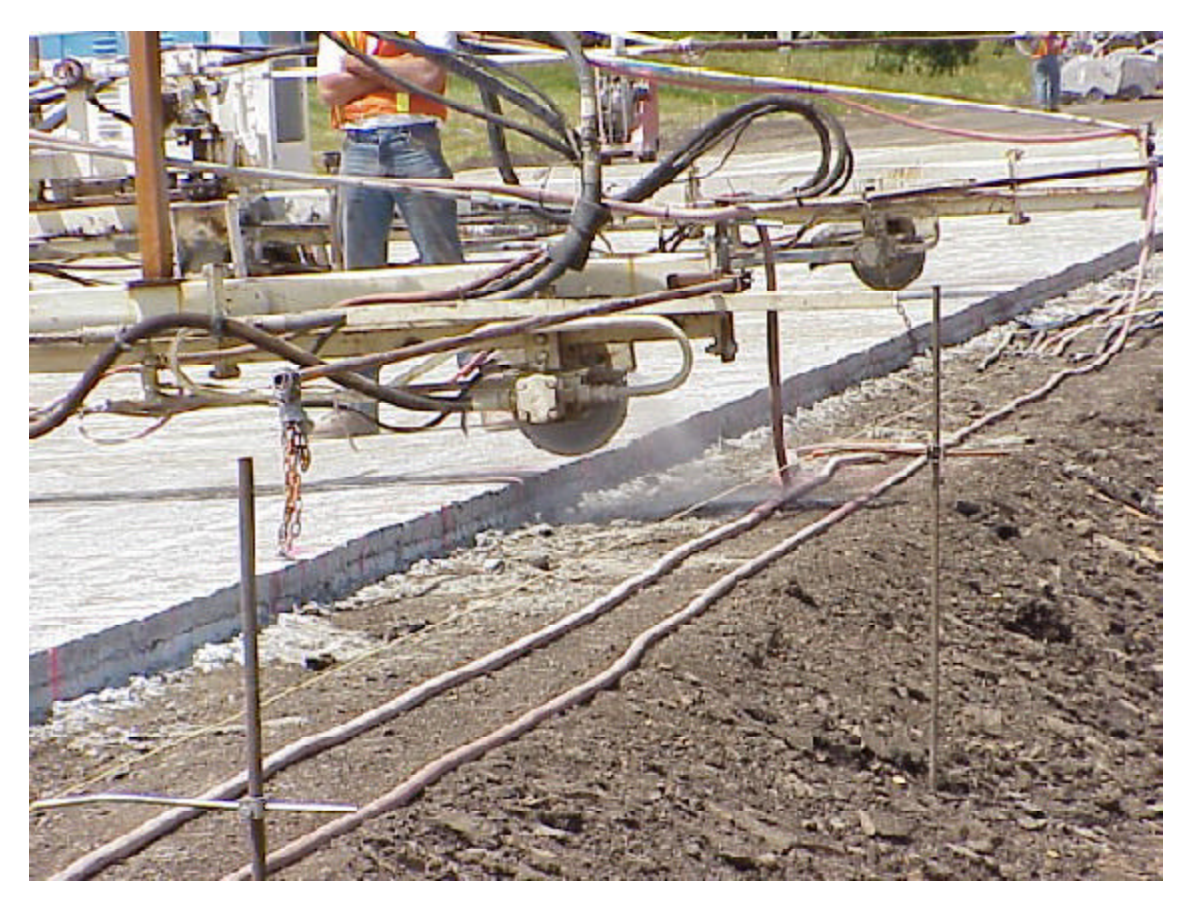
Whitetopping is a thin concrete overlay over asphalt pavement. It is used as a rehabilitation method.