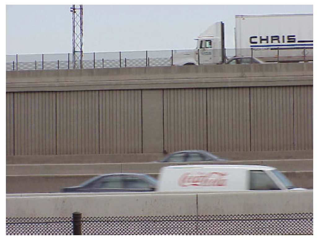
This mechanically stabilized earth wall, with independent full-height facing, is part of the ramp connecting N.B. 125 to 170 in Denver.

Recommendations from the report: The report provides insight into the details, materials, design, and construction of the I25/I70 MSE/IFF walls. The collected instrumentation results are also presented and utilized in the assessment of the design and performance of the MSE/IFF wall structure. The flexibility of the MSE/IFF wall system smoothly accommodated the wall movements and kept the lateral earth pressure against the wall facing to a low value of 32 psf. The report also provides thorough details and the basis for future standard use of MSE/IFF walls.