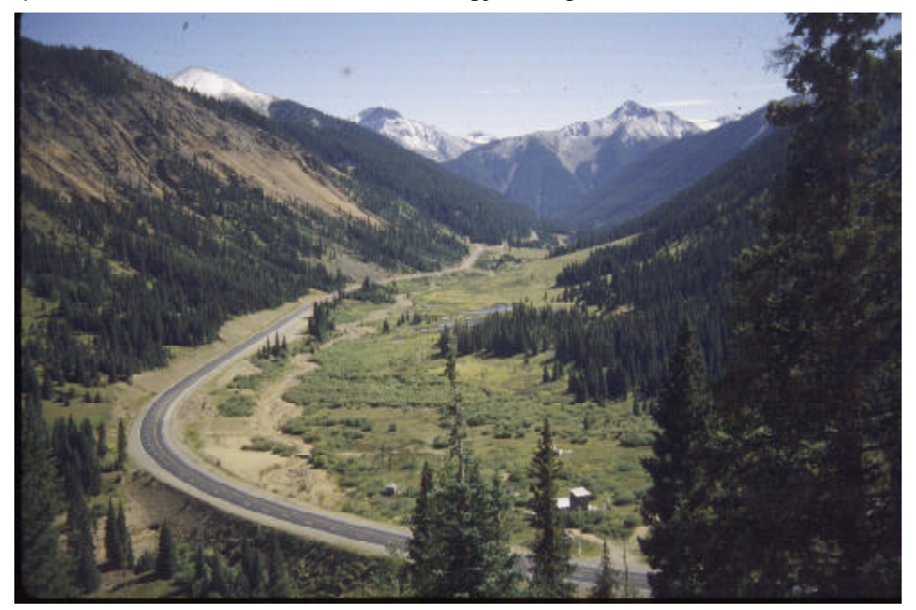
This photo is of the Million Dollar Highway, near Silverton.

Expected Implementation: Assessment Methodology Change