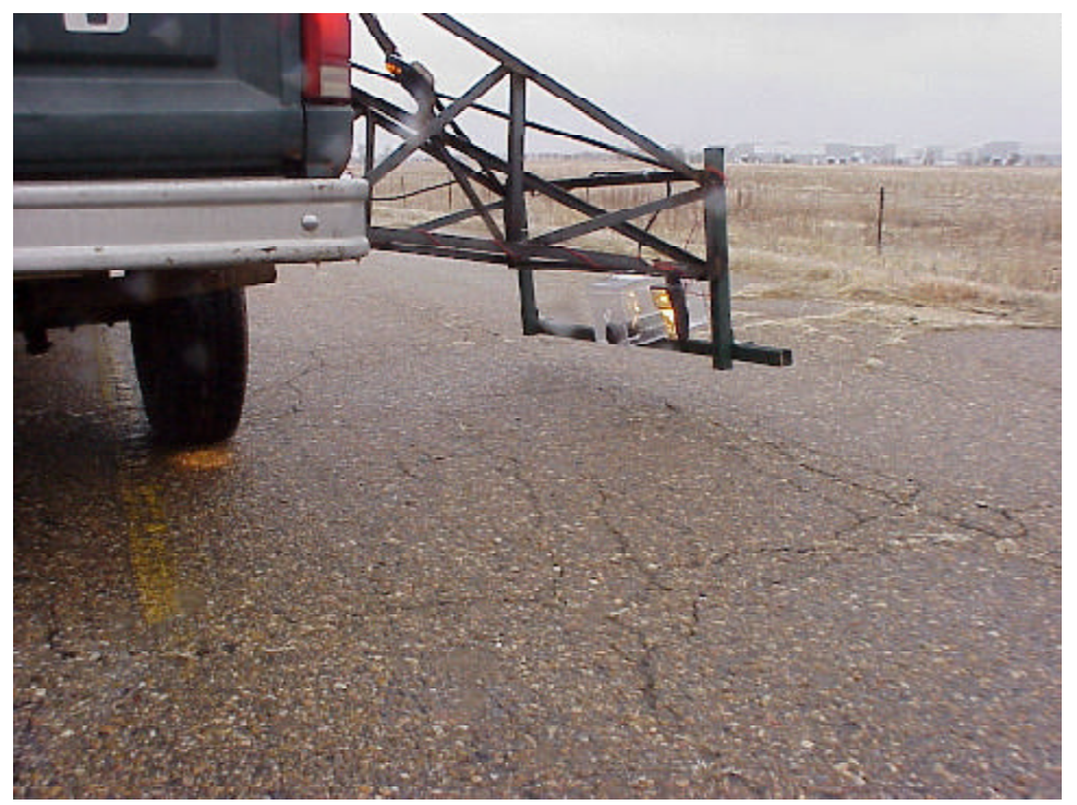
This high speed video camera is observing sand particle movement.

CDOT Maintenance can spend one-third of its budget every year handling snow and ice removal. While sand/salt have been traditionally used, chemical deicers have also been found to very effective. This study addresses only the true economic cost of using sand/salt. While the CDOT Maintenance Division keeps good records on the amount spent for sand/salt, there are several other costs associated with street sanding. This study will identify those costs and an overall cost/benefit analysis of the street-sanding program. In addition, the study will look into vehicle damage which may/or may not be caused by either method. This report will be available in late 2001. Early recommendations from the report call for enforcing the maximum gradation specification for sand and encouraging the shift from the sand/salt mixture to deicing chemicals.